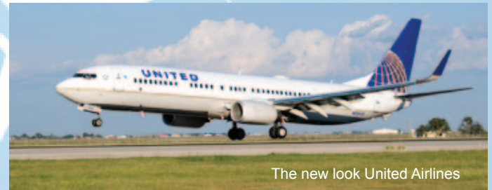
The new look United Airlines

IAG have also agreed an $8 billion transatlantic joint business route merger deal with American Airlines . The three airlines are strengthening their existing oneworld alliance ties but have had to stop short of a full financial merger because of strict U.S. laws that bar foreign ownership in the airline industry.